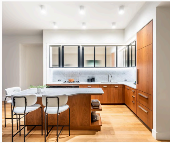
A kitchen in a residence, featuring white oak flooring and marble.