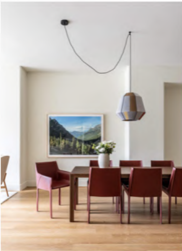
The soft curves on the interior architecture match the exterior façade. EVAN JOSEPH

Upon entering Greenwich West, residents will walk up grand marble stairs to a double-height lobby, made with travertine, leather-paneled walls and rosewood millwork. Segers wanted residents to feel the building's personality through the materiality.