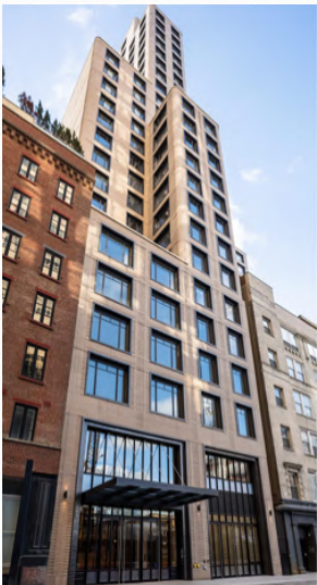
The exterior of Greenwich West. ALAN TANSEY

The tower, which makes a mark on New York City's skyline and is one of the tallest in the area, spans 30 stories (at 290-foot high) and has 170 loft-style residences. The condo building has studios to three bedrooms, including penthouses, with pricing ranging from $1.1 to $7.95 million. It pairs high design with French elegance.