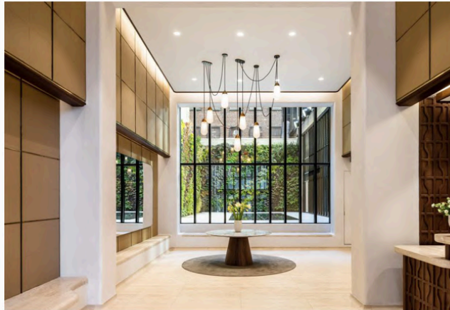
The stunning lobby, featuring Carrara marble.